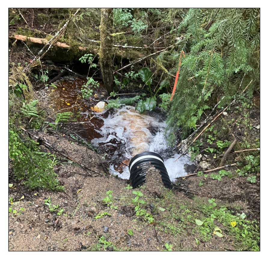
Figure 2.—Culvert and channel at waypoint 1526.