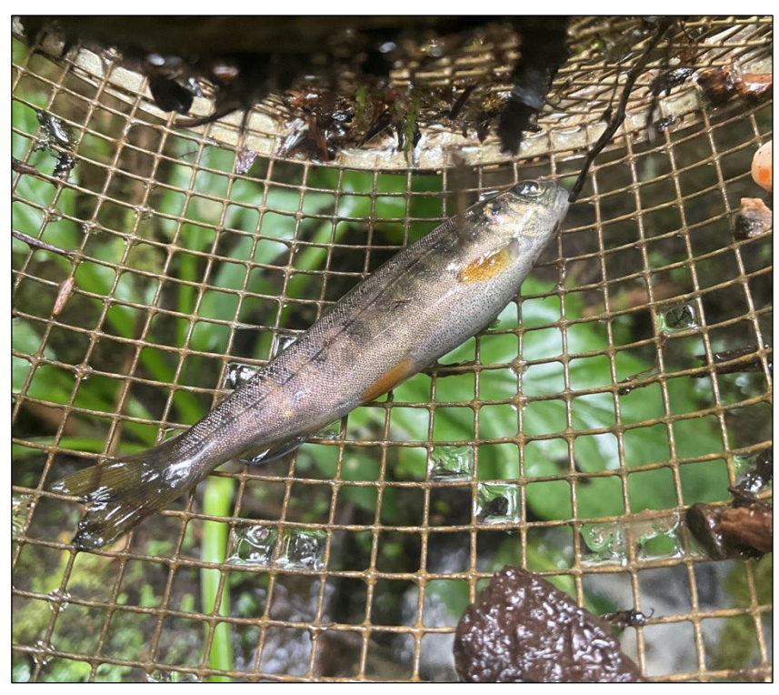
Figure 1.-Juvenile coho salmon captured at waypoint 1526.